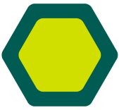
Diagram: RainStor can take structured data from any source, store it efficiently on any platform, and provide on-demand access using full SQL through any industry standard reporting or BI tool.